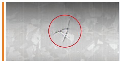
Crack inspection (solar wafer)