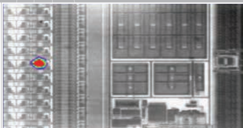
• Semiconductor inspection