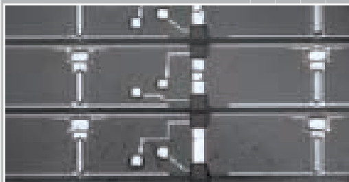
• Semiconductor analysis