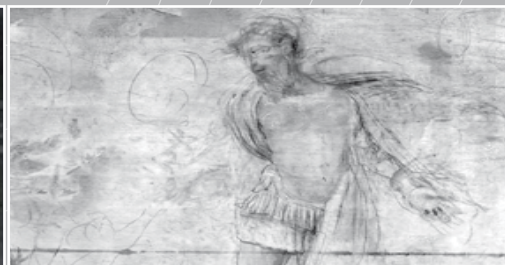
• Art inspection